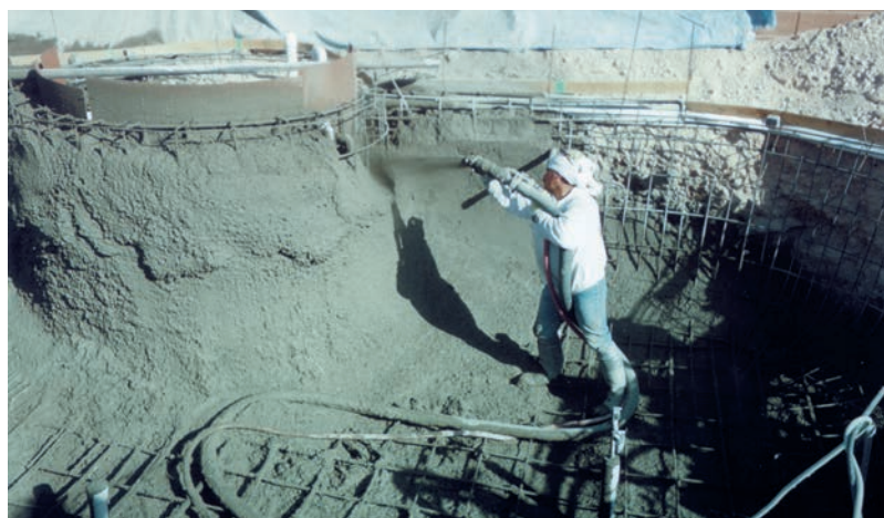
The LS500, with its powerful ability to handle the toughest shotcrete mixes, enables a swimming pool contractor to apply shotcrete to two pools a day.

The economical way to place up to 1½" aggregate concrete pump mixes.