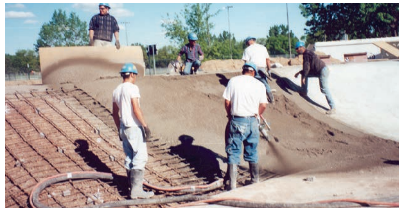
Shotcreting (wet gunning) with a stiff, low-slump shotcrete mix is all in a day's work for the Mayco C30HD.