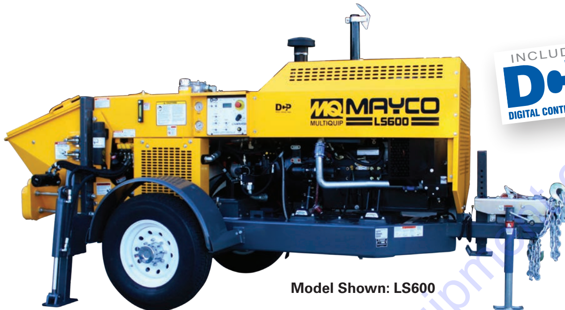
Model Shown: LS600