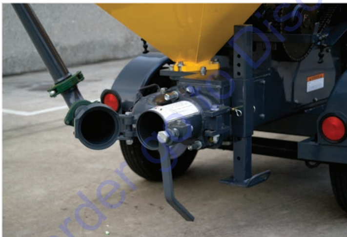
E-Z open hinged manifold requires no special tools required for service or maintenance. Swings away for easy travel and cleaning