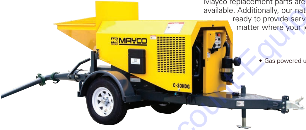
• Gas-powered unit: C30HDG

Mayco replacement parts are reasonably priced and readily available. Additionally, our nationwide network of dealers is ready to provide service and technical support no matter where your job is located.