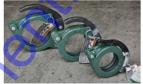
Multiquip uses conforms couplers