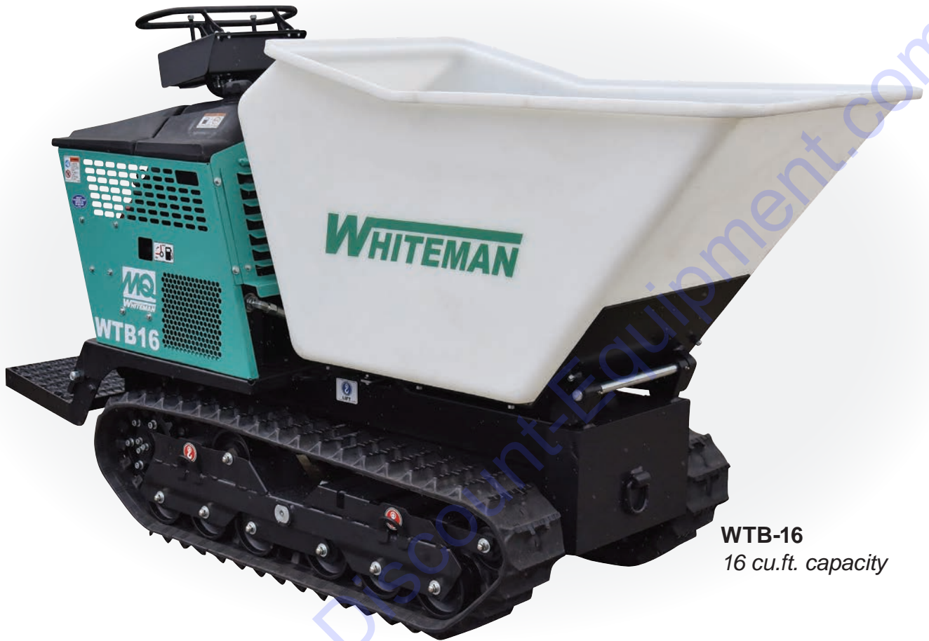
WTB-16 16 cu.ft. capacity

is engineered with top quality components and built with the attention to detail that has made MQ Whiteman the leader in motorized buggies.