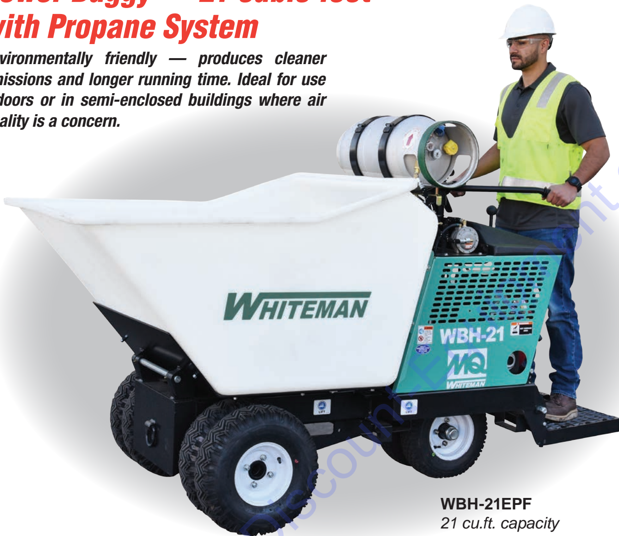
WBH-21EPF 21 cu.ft. capacity

Environmentally friendly — produces cleaner emissions and longer running time. Ideal for use indoors or in semi-enclosed buildings where air quality is a concern.