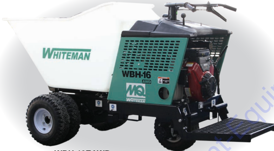
WBH-16EAWD 16 cu.ft. capacity Features electric start Vanguard engine

gravel. Heavy duty main frame provides structural integrity with low center of gravity for increased stability and traction.