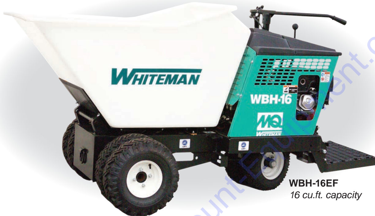
WBH-16EF 16 cu.ft. capacity

The MQ Whiteman Power Buggy is the preferred choice of contractors due to its dependability and versatility.