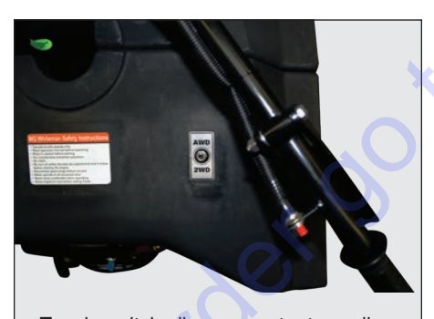
Toggle switch allows operator to easily switch from two-wheel drive to all-wheel drive.

Hydraulic hoses are located within the frame for fast access and protection.