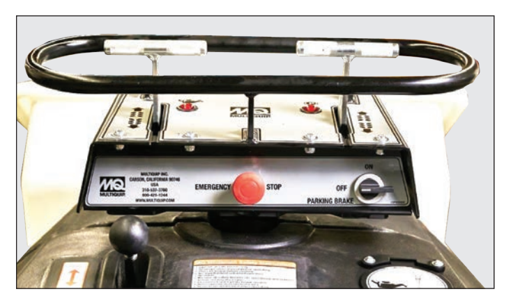
Dual control handles provide consistent tracking, easy steering, and minimized operator fatigue.