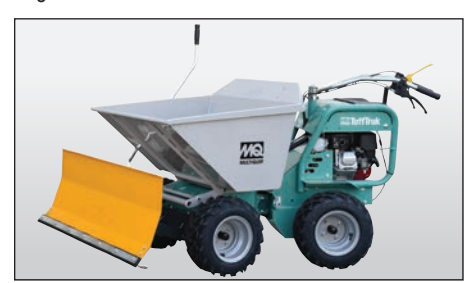
TuffTruk Snow Plow — TSP — perfect for displacing snow during poor weather conditions.