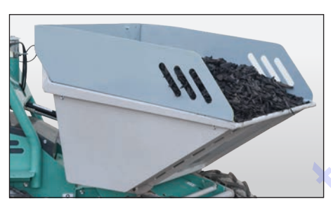
TuffTruk Extension Kit — TTE — 33.4 or 29.0 inch width, ideal for increased capacity when carrying light loads.