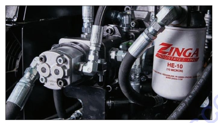
100% hydraulic drive — No V belts, pulleys, clutches or mechanical gear reductions.