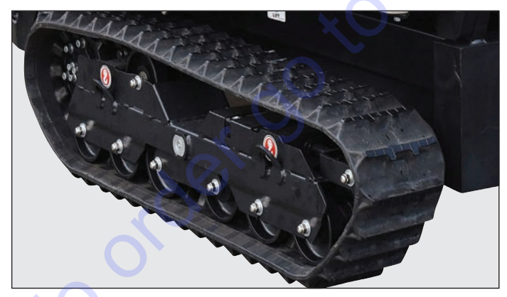
Aggressive tack pattern for use in soft soil to muddy site conditions.