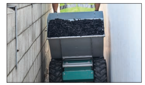
7 ft³ clip-on tub — TT7 — allows access through narrow 32-inch passageways.