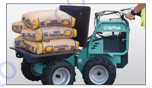
TuffTruk Flatbed — TFB33 and TFB29 — 33.4 or 29.0 inch width, ideal for transporting heavy bags of material.