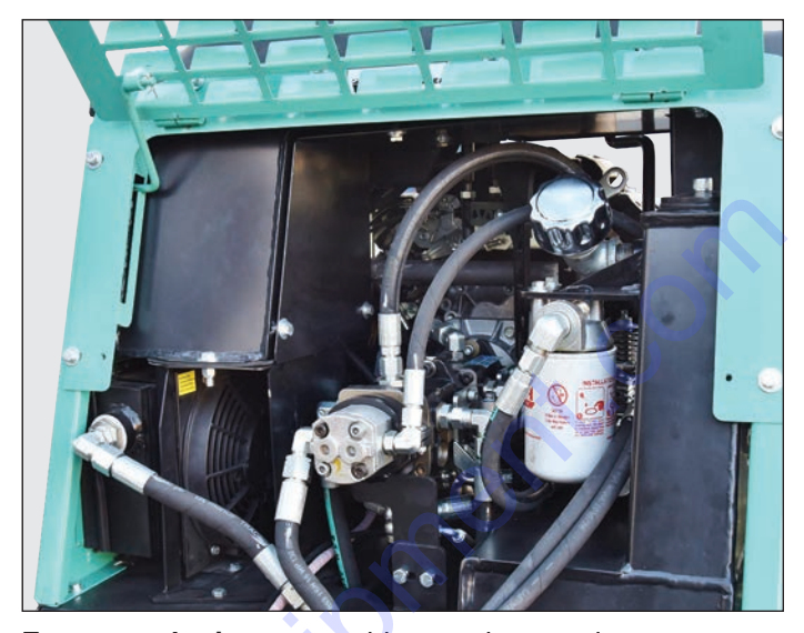
Front panel raises to provide complete service access.