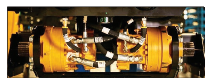
Premier high torque Poclain hydraulic motors feature fail-safe brakes.