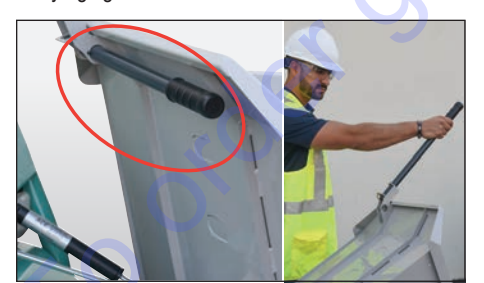
TuffTruk Dump Handle — TTH — for added convenience when discharging tub uphill.