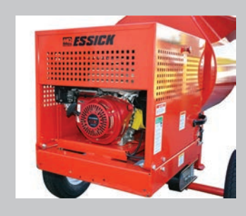
Convenient access to engine controls and recoil.