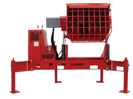
PRO12 - retractable, swing away stabilizers adapt to application requirements.