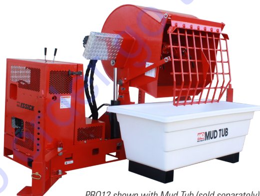
PRO12 shown with Mud Tub (sold separately)