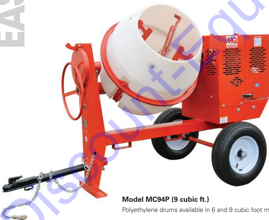
Model MC94P (9 cubic ft.)

The MC12PH concrete mixer handles your biggest and toughest applications. It features a 12 cubic ft. Easyclean™ drum and powerful Honda GX340 engine.