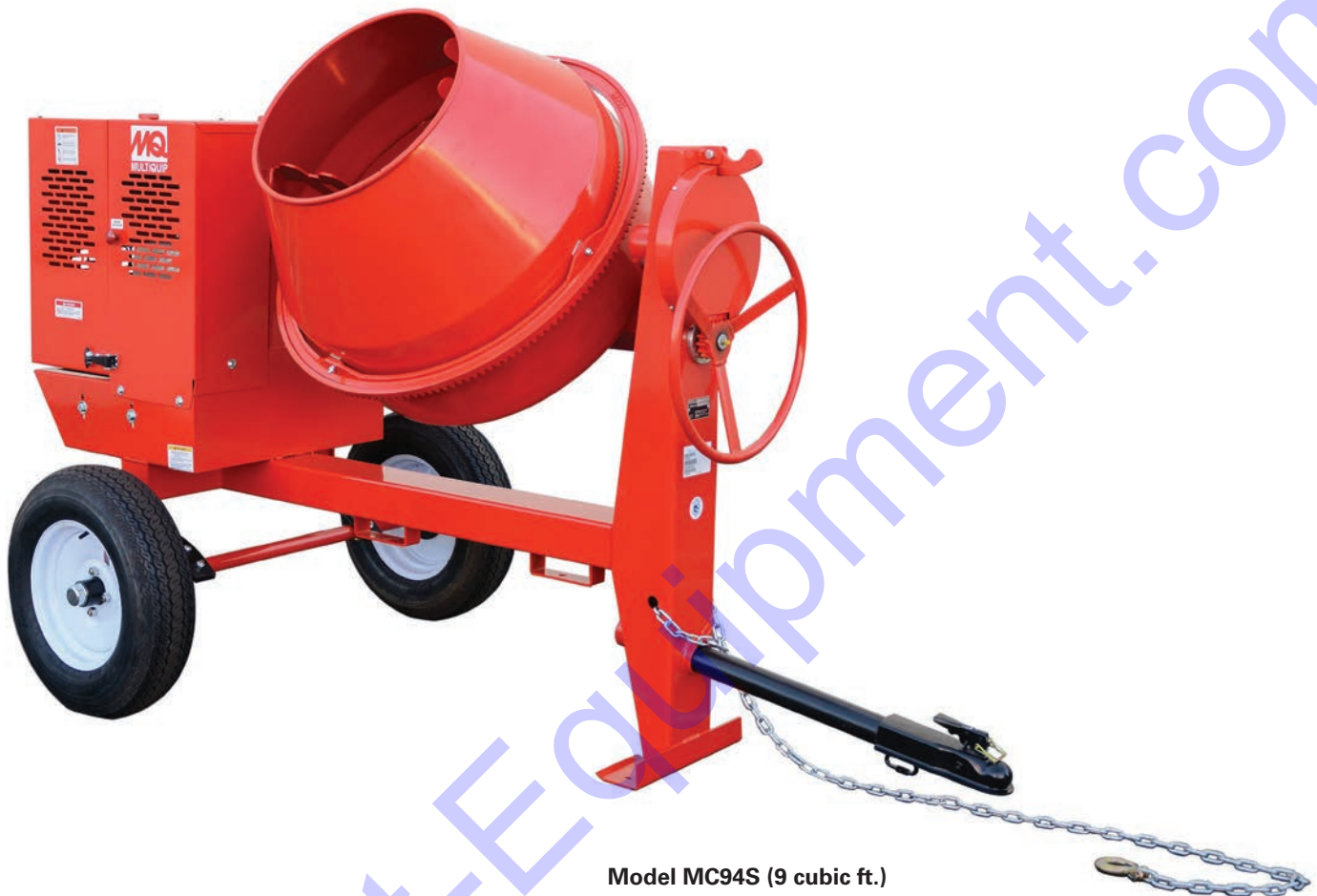
Model MC94S (9 cubic ft.)

Multiquip concrete mixers are available with either steel or polyethylene drums. Their durable construction and low maintenance requirements will provide you with years of reliable service.