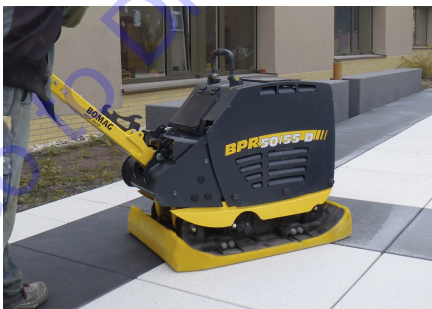
No breakage of paving stones