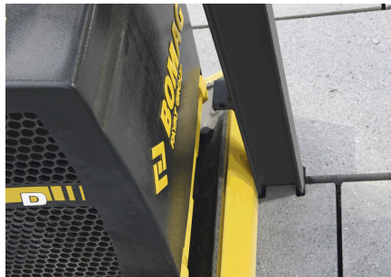
No damage to installations and borders