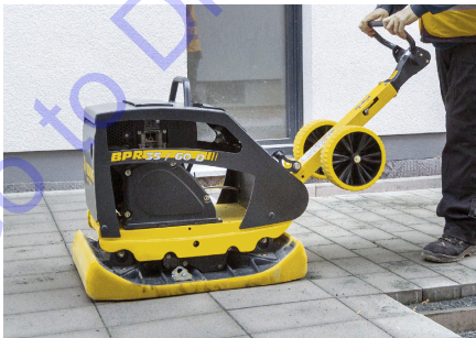
No breakage of paving stones