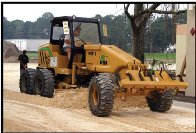
The MG618's 32° of Articulation and 20° of Wheel Lean shine in tight parking lots where maneuverability and the ability to carry large blade loads are required.

Over 9,500 lbs. of Blade Down Pressure allow the MG618 to cut material that other graders would scarifier first.