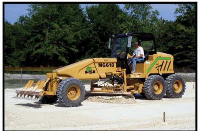
With 45° of Moldboard Tilt, the MG618 is perfect for blue-topping parking lots, driveways and shoulders.