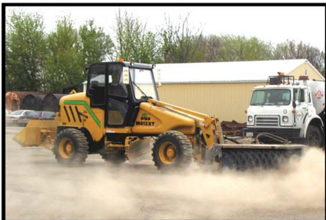
M413XT with 84" Broom attachment adds versatility and productivity.

The M413XT's small footprint makes it the perfect choice for working in tight areas like this alley.