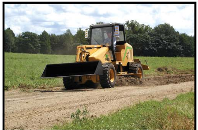
Impressive Weight-to-Horsepower performance enables the M413XT to tackle the most demanding jobs.