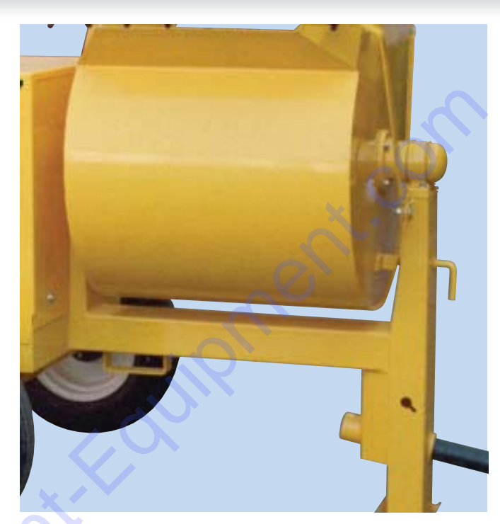
Thick tubular steel reinforced frame resists damage, provides superior strength and good dumping clearance.

Drum lock allows positive "mix" and tow" positions.