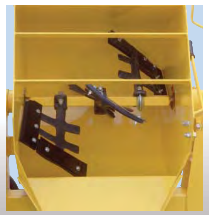
Built to last. Durable 11-gauge steel drum. High strength paddle arms with rubber wipers pitched at 45° provides fast, uniform mix.