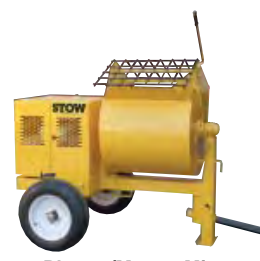
Plaster/Mortar Mixer Model MS93 (9.3 cu. ft.)