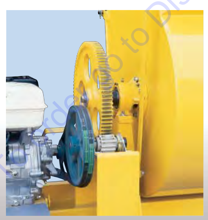
Extra heavy duty solid 1½" wide bull gear with steel heat-treated pinion gear greatly increases service life under harsh mixes.