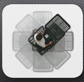
Zero Turning Radius Compact design allows the MSP Series to turn on its own axis.

MSP Series lifts are ideal for stores, warehouses and storage areas where space is limited.