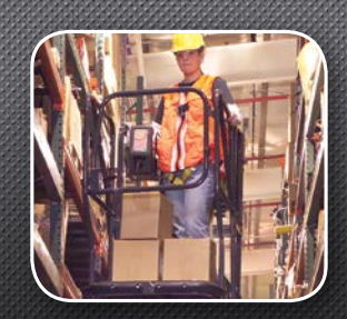
Greater Access Compact dimensions for getting into hard-to-reach areas.

Workers can handle more boxes, supplies, tools or other items with an adjustable, heavy-duty steel material tray.