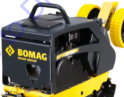
Robust and reliable Best component protection