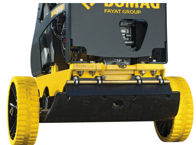
Simple and safe transport Transport wheels (optional)