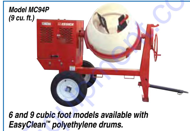
Model MC94P (9 cu. ft.)

Available in 4, 6, and 9 cubic foot capacities, with your choice of power sources and drum materials.