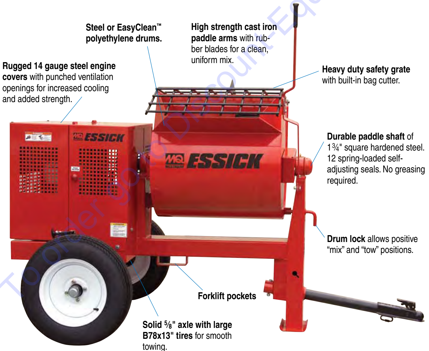
Model EM70S (7 cu. ft.)