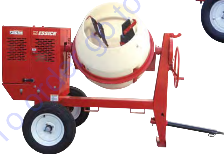
Model MC94P (9 cu. ft.)