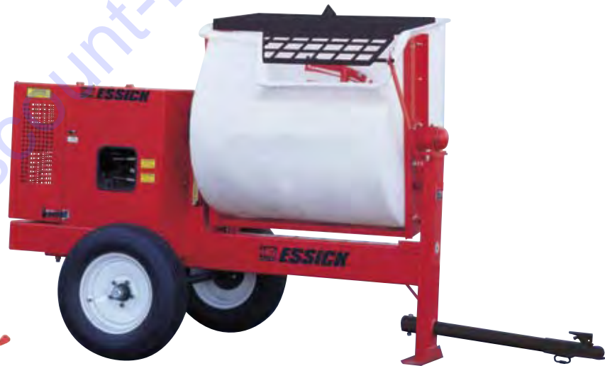
Model EM120PH (12 cu. ft.)

Our tough polyethylene drums can be cleaned in minutes. A simple tap with a rubber mallet does the job — without dents, rust or cracks!