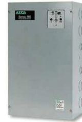
Optional Automatic Transfer Switch