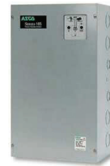
Optional Automatic Transfer Switch