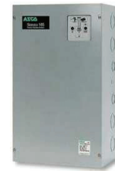
Optional Automatic Transfer Switch