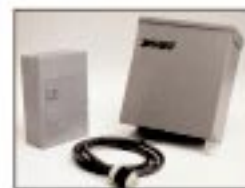
Emergency Transfer/Service System