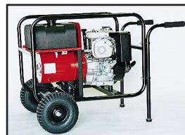
All-Terrain 2 Wheel Dolly Kit

NOTES: (1) Based on gasoline fuel. Derate 10% for L.P. gas, 20% for Natural Gas. (2) Code G capacitor start motor. (3) Electric start models include battery rack and cables. Battery not included. (4) COMMERCIAL OR PRIME POWER WARRANTY - 90 Days, INTERNATIONAL WARRANTY - Contact WINCO for details.