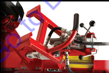
Spring loaded wedge cleaner