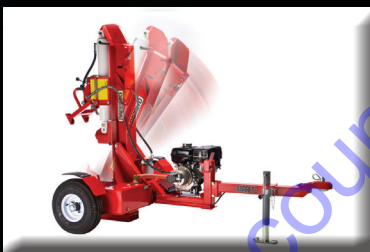
The rugged, heavy duty design will hold up to the challenges of the job