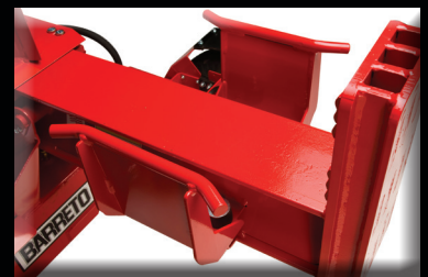
Cushion mounted log cradle is designed to snap out of the way when using the splitter in the vertical position