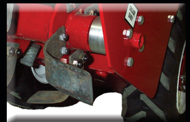
Counter-rotating tines cut through sod and hard packed soil