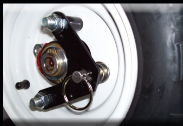
Hubs unlock to free-wheel the tiller when the engine isn't running