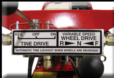
Simple controls are easy to learn and easy to operate