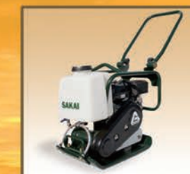
Vibratory Plate Compactors