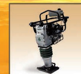
High Impact Rammers