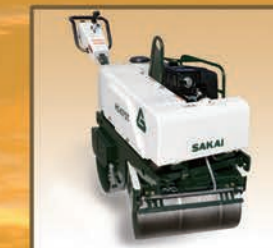
Compact Vibratory Soil Compactors