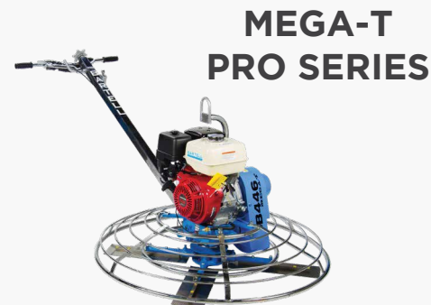
MEGA-T PRO SERIES