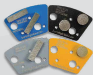
TOOLING & CONSUMABLES