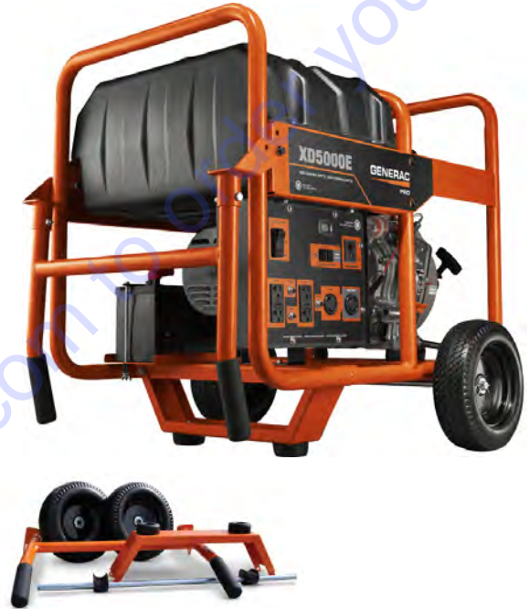
Portability Kit sold separately. Part No. G0069100

AC Rated Output Running Watts 5000 AC Maximum Output Starting Watts 5500