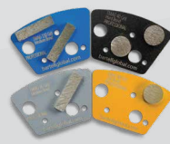
TOOLING & CONSUMABLES