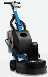
GRINDERS & POLISHERS