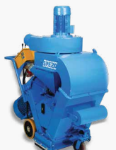
SPE 20ES ELECTRIC DRIVE