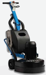
GRINDERS & POLISHERS