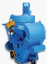
SPE 20ES ELECTRIC DRIVE