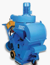
SPE 20ES ELECTRIC DRIVE