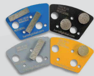
TOOLING & CONSUMABLES