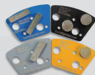
TOOLING & CONSUMABLES