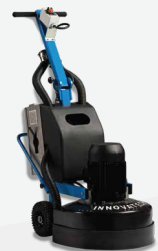
GRINDERS & POLISHERS