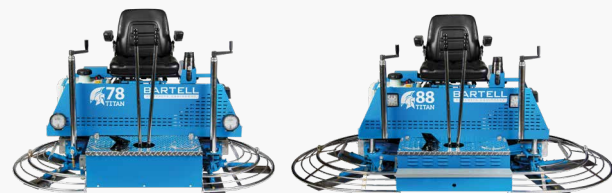
TITAN 78 TITAN 88