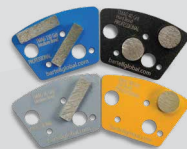
TOOLING & CONSUMABLES