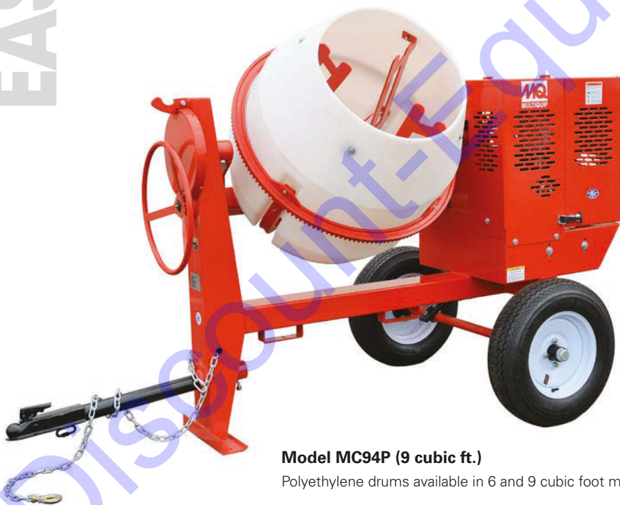
Model MC94P (9 cubic ft.)

The MC12PH concrete mixer handles your biggest and toughest applications. It features a 12 cubic ft. Easyclean™ drum and powerful Honda GX340 engine.