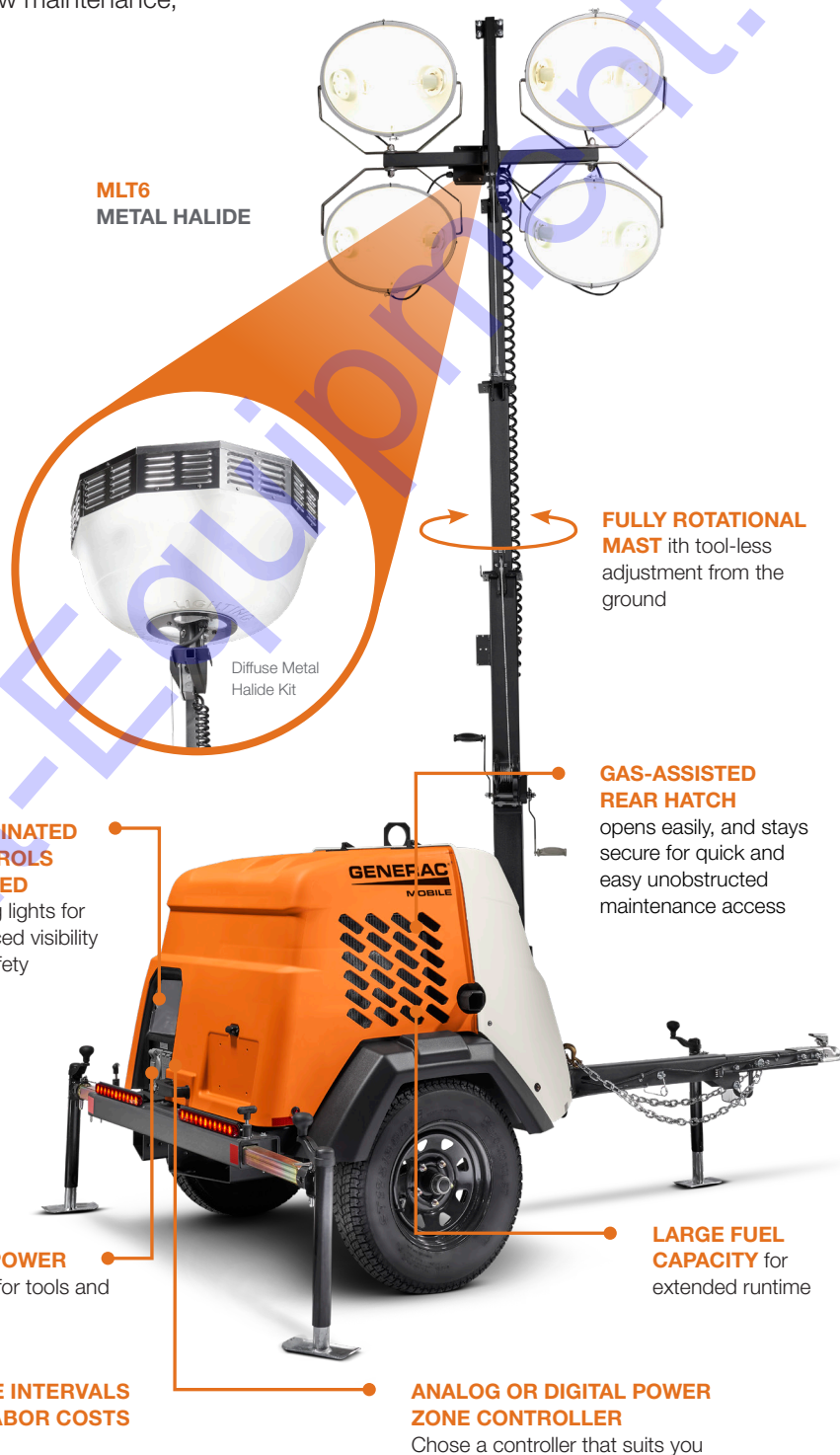
MLT6 METAL HALIDE

FULLY ROTATIONAL MAST with tool-less adjustment from the ground