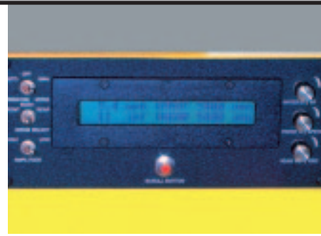
The MSPI system delivers ultimate control over productivity