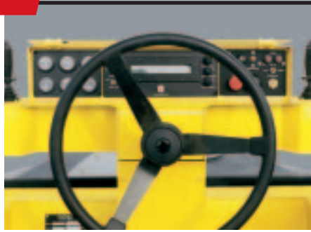
Two levers control travel direction, speed, manual vibration on/off and MSPI input