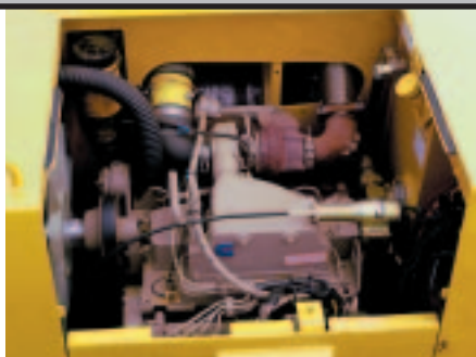
The engine is placed low in the frame for ease of service and operator visibility