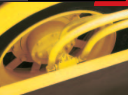
Radial pneumatic isolators ensure vibratory energy is transmitted to the work, not the machine