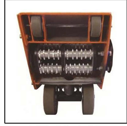
Available with Tungsten Cutters

Designs and specifications subject to change without notice or obligations. Exact weights are dependent upon power source.