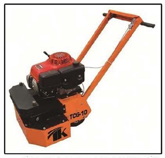
Designs and specifications subject to change without notice or obligations. Eact weights are dependent upon power source.