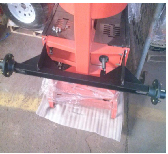
Last Revision: 08/21/2012