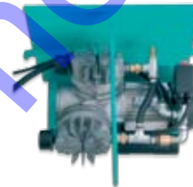
Optional continuous duty dual diaphragm air compressor.