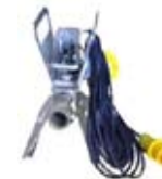
Optional Grout injection kit