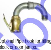
Optional Pipe hook for filling block or door jams.