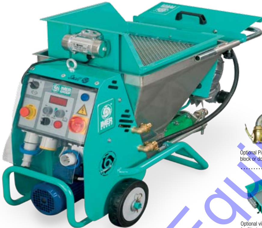
Shown with optional vibrating screen and compressor

– Lindsay Hatch, Hatch Masonry, Cherokee, IA