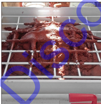
Easily pumps traditional stucco