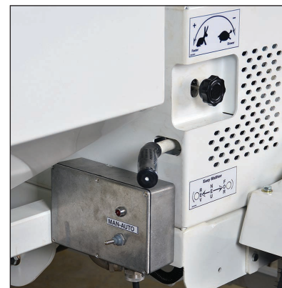
Simple, easy-to-use controls