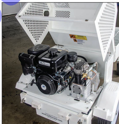
Easy-to-access engine and compressor