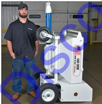
Portability – will easily stand on end to fit into a service elevator