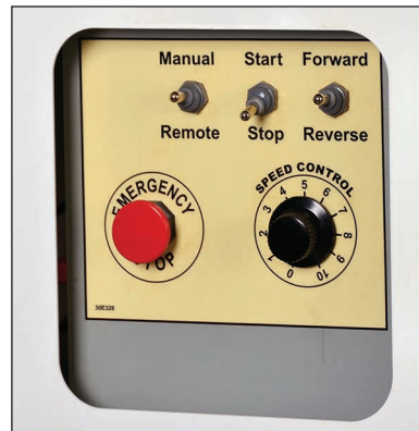
Simple, easy-to-use controls