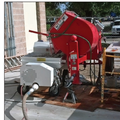
Works well with standard mixer