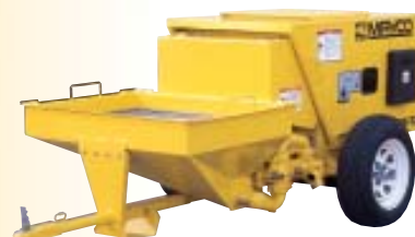
Plaster & Fireproofing Pump