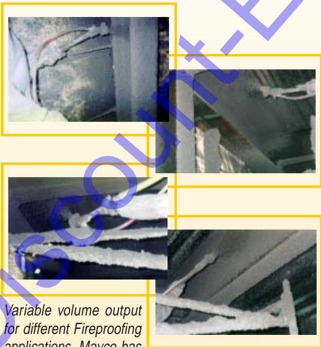
Variable volume output for different Fireproofing applications. Mayco has the right pump for your job.