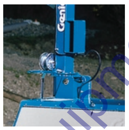
Easy to use winches are mounted high on the machine, allowing the operator to stand upright while raising/lowering the mast.

Genie models feature horizontally mounted bulbs in heavy duty frames, that generate up to 40% more light. This mounting system also projects a wider beam spread and a more even distribution of light over the jobsite — reducing the "hot spots" and dark areas between lighted circles.