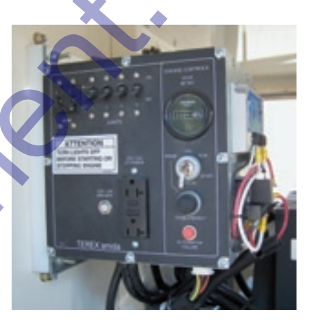
Control box shown with optional Roda Deaco electronic air shutdown system (model AL5000).