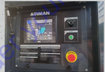
1.2 | Digital Touch Screen Control with Power Switch, Start Button, & Emergency Shut-off Button

Kubota® V5009 Tier 4 / CARB Diesel Engine