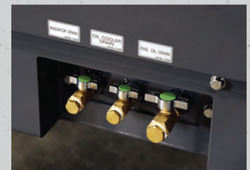
9 | Exterior Service Drains Quick drain valves for the Radiator, Oil Cooler and Engine Oil fluids