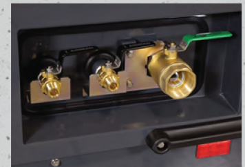
3 | Quick Access Air Connections 3/4" Ball Valve x 2 | 2" Ball Valve x 1