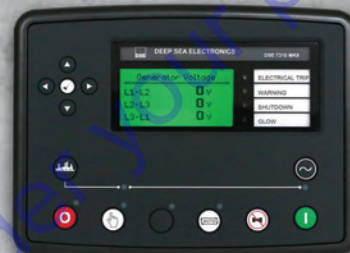
1 | DSEgenset® Digital Control Panel Model 7310 MKII