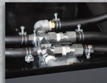
10 | External Fuel Tank Connections with 3-Way Selection Valve

BEST-IN-CLASS dBA RATING // 24-HOUR RUNTIME // EXCELLENT MOTOR STARTING THE INDUSTRY'S HIGHEST-QUALITY MOBILE GENERATORS