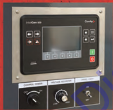
Paralleling Control Panel