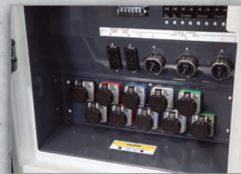
2 | Single-Phase Receptacles 120V - 20A x 2 | 240V - 50A x 3 Optional Dual Row Cam-Loks™ Shown