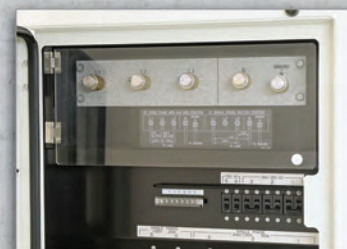
3 | Large Electrical Output Lugs 3Φ Output - 480V & 240V or 208V