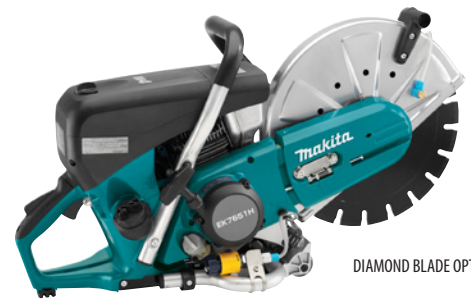
DIAMOND BLADE OPTIONAL