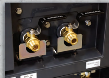
2 | Air Connections 3/4" Male Ball Valve x 2