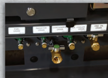
8 | Exterior Service Drains Quick drain valves for Fuel, Oil Cooler, Radiator and Engine Oil fluids