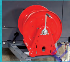
Single Hose Reel Kit