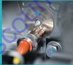
Engine Block Heater