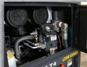
9 | Air Filter Access Door Easy access for fast filter replacement

BEST-IN-CLASS POWER TRANSFER // FUEL EFFICIENCY // dBA RATING THE INDUSTRY'S HIGHEST-QUALITY MOBILE AIR COMPRESSORS