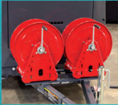
Double Hose Reel Kit