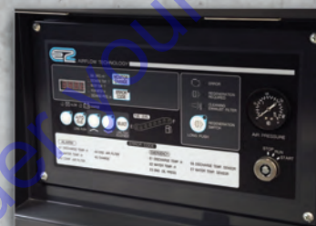
1 | Keyed Start and Digital Monitor with fuel-saving Auto Idle Mode