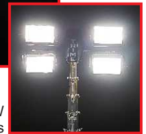
320W Light Heads