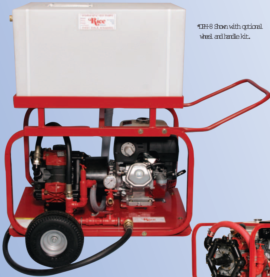
*DPH-8 Shown with optional wheel and handle kit.

The DP Series hydrostatic test pumps are large volume, medium pressure units, with flow rates up to 56 GPM and pressures up to 600 PSI. Designed to quickly fill and test lines up to 96" in diameter. Unique to the diaphragm pumps are their ability to handle up to a 10% chlorine solution, and can be run dry without damage to the pump.