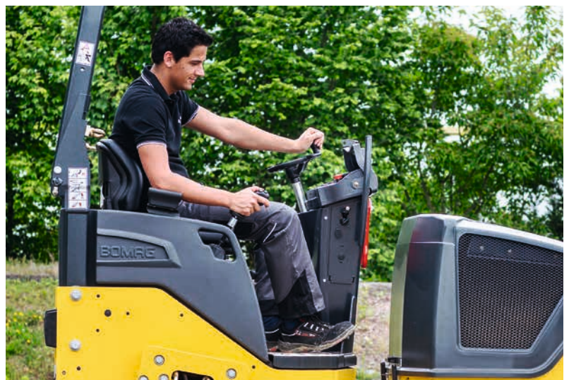
Ample leg room for the operator ensures a comfortable working environment.

The response of the control lever is very pleasant; reversing is modulated and very precise. Drum vibration can be activated selectively for the front or rear only, or for both drums. In tandem with the IVC (Intelligent Vibration Control) system, the exciter system guarantees consistent compaction and reliable operation at all times.