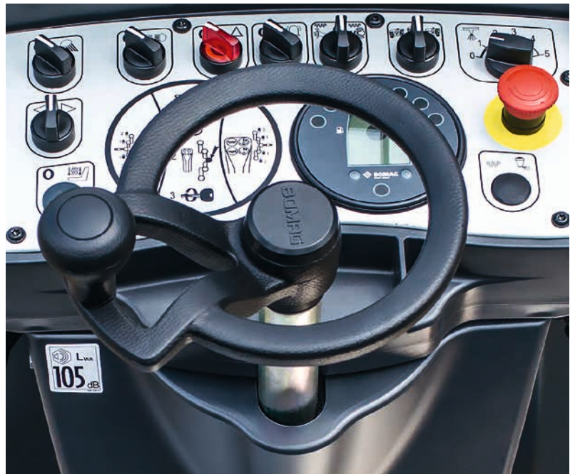
Large switches, a compact steering wheel and clearly arranged controls make it easy for any operator to work with a light BOMAG tandem roller.

Every function is self-explanatory and intuitive to operate after a very short time. As with every BOMAG tandem roller, the main functions can be selected precisely and error-free by the ergonomic control lever.